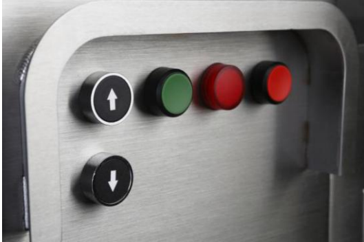
The control panel

- easy to recognize and simple to operate.