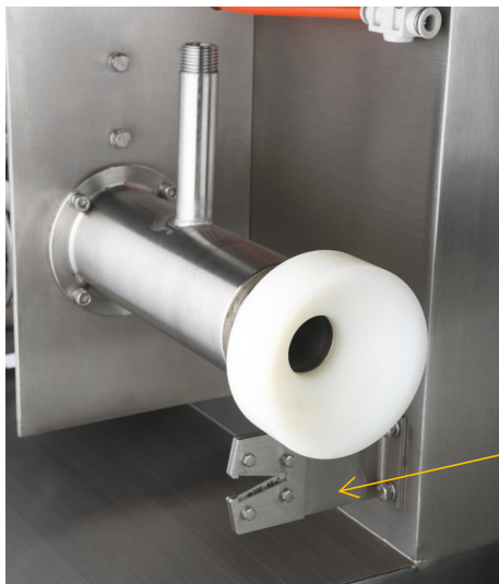
The sausage input

- made of complete stainless steel SUS304 - robust, reliable and rapid